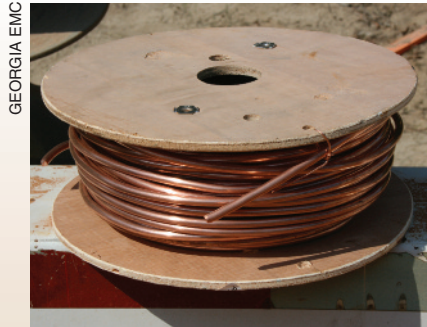
In Georgia, there is a $3,000 reward for information that leads directly to the arrest and conviction of someone involved in copper theft from any electric utility's property.