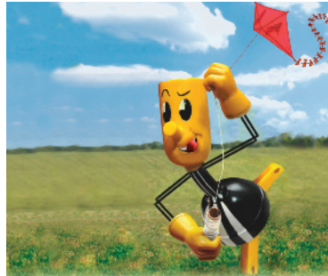
Willie Wiredhand knows to fly a kite away from power lines.