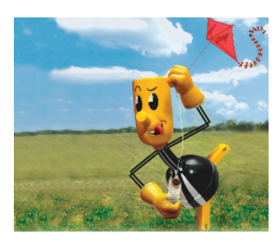
Willie Wiredhand knows to fly a kite away from power lines.

Keep liquids, including drinks, away from electrical items such as TVs, video-game consoles and computers. Liquids could spill and cause dangerous shocks or fires.